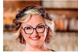
Julie Goodwin Chef, TV presenter and author